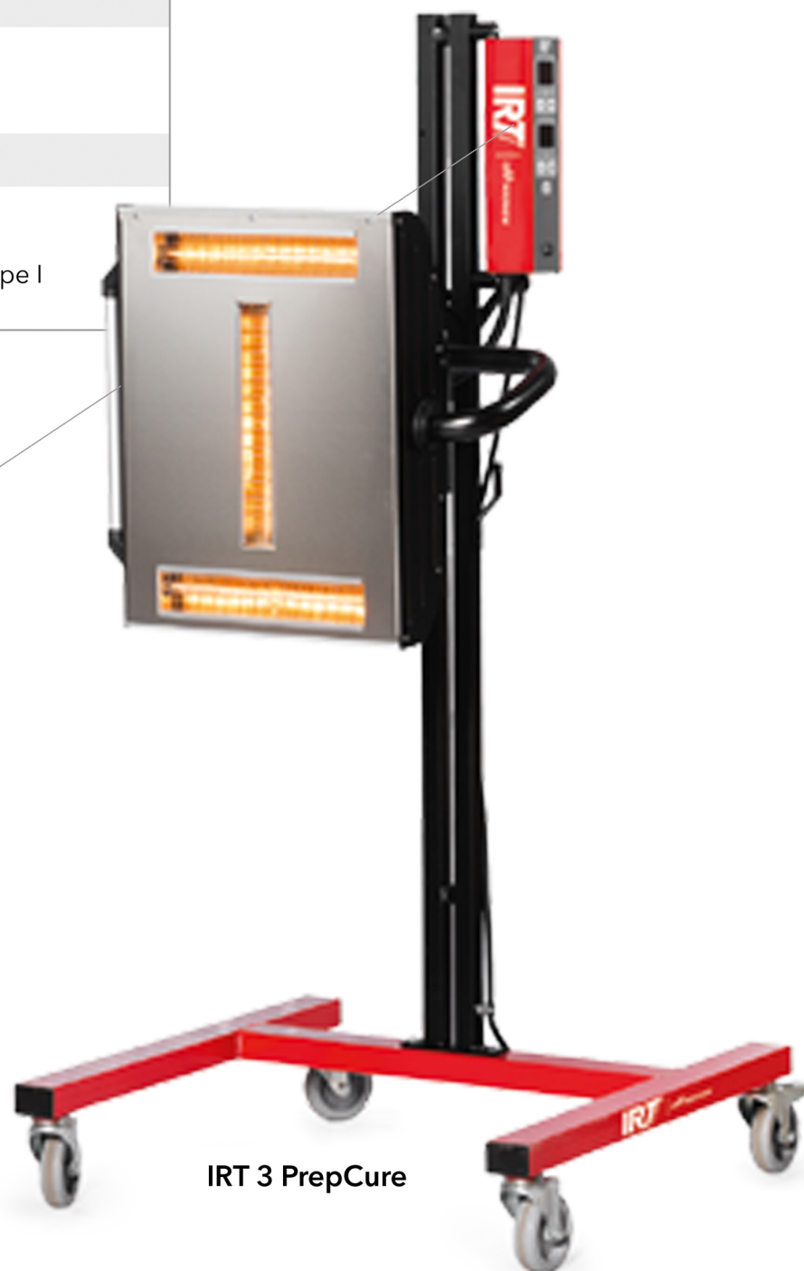
IRT 3 PrepCure